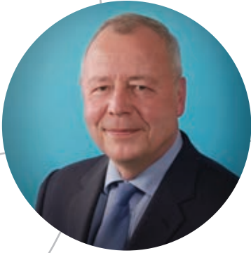
Jean Launay, President of the French Water Partnership

“Empowering the future generation of water heroes is what we need to face today’s global challenges”